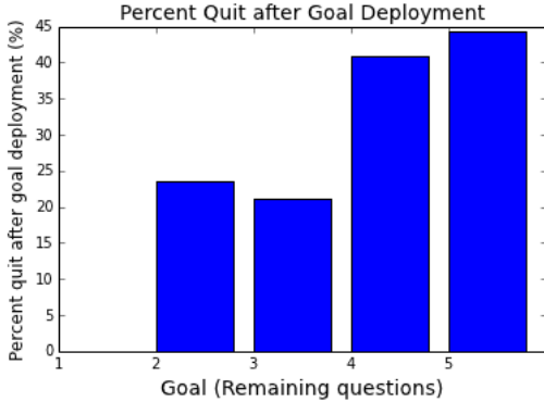
Figure 2: Percent of users who drop out after a dynamic goal is deployed. No users drop out if the dynamic goal is one additional question.